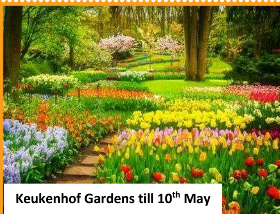
Keukenhof Gardens till 10 th May

(Important Note – Keeping in mind the logistical consideration the Tour Manager reserves the right to alter or change the itinerary. However, we will ensure that all the attractions are covered)