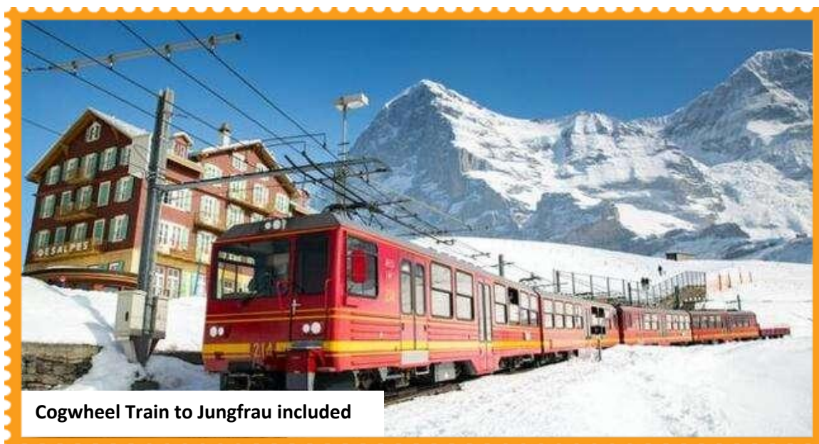
Cogwheel Train to Jungfrau included

Upon arrival, you'll find yourself in a realm of eternal ice and snow, where natural beauty knows no bounds. Explore the enchanting Ice Palace, where skilled artists craft their masterpieces