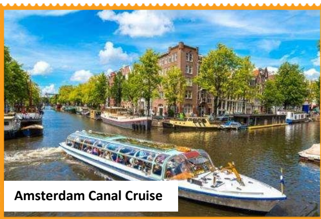
Amsterdam Canal Cruise