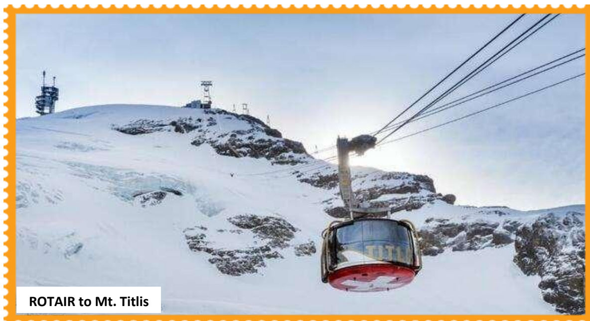
ROTAIR to Mt. Titlis