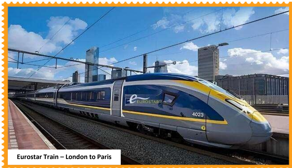
Eurostar Train – London to Paris