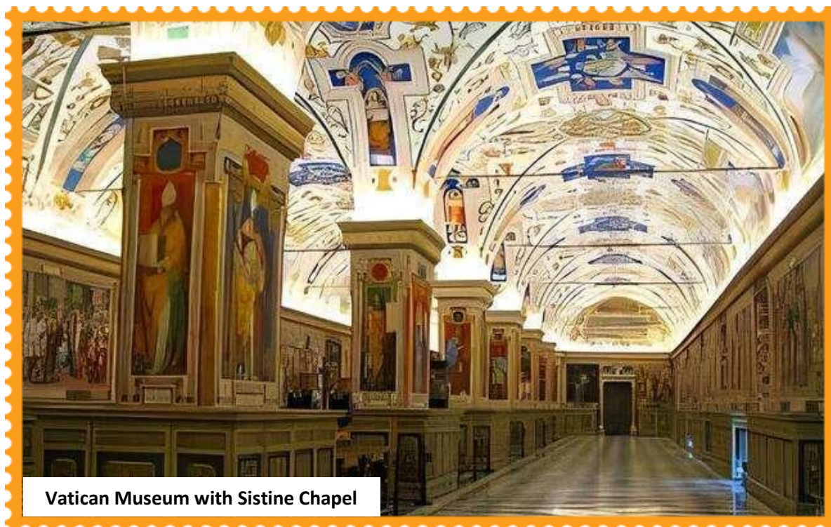
Vatican Museum with Sistine Chapel