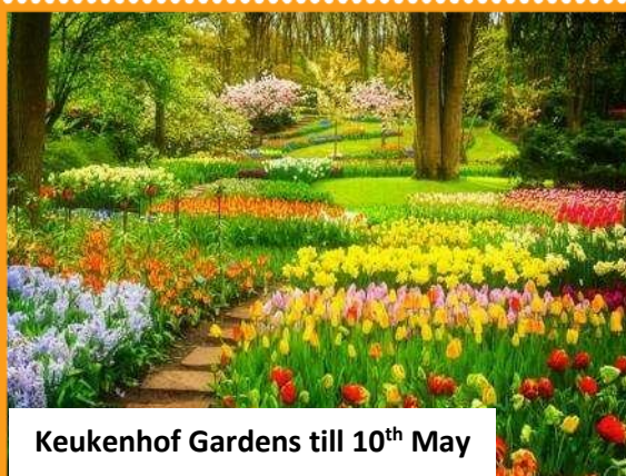
Keukenhof Gardens till 10 th May