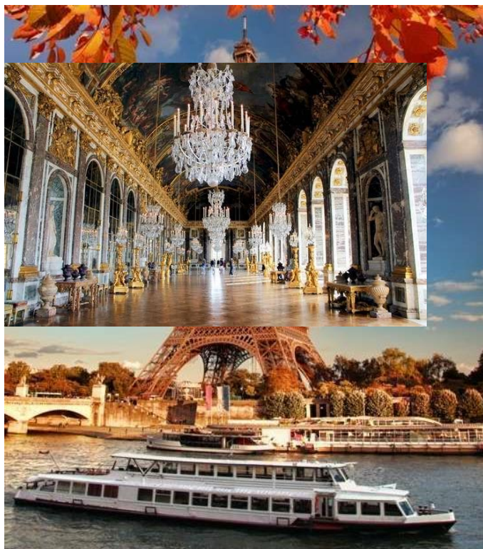
Eiffel Tower & River Seine Cruise

Overnight stay at hotel in Paris. (Dinner)